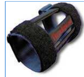
Flexible Throwing Brace ThrowMax