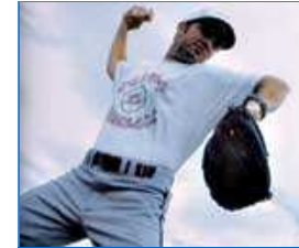
Professional Throwing Program Armed and Ready