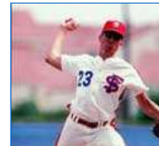
Mechanics & pitches Pitching From the Ground Up